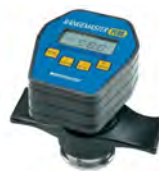
Portable Hardness Testers