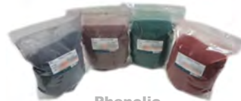
Phenolic Mounting Resins