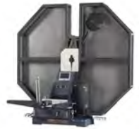
Charpy Impact Testers