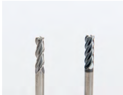
Diamond Cutting Blades