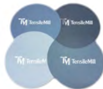
Grinding Paper and Diamond Abrasive Suspension