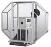
Pendulum Impact Testers