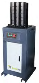
Notch Making Machines