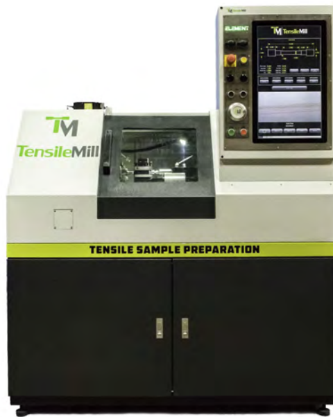
TensileTurn CNC Round Tensile Sample Preparation Machine

This classic tensile sample preparation machine is designed to accommodate round tensile specimen requirements from both round and square stocks as well as other CNC machining requirements. The standard tensile software included with the unit allows for round tensile milling results in seconds with a push of a button. This industrial, user-friendly machine can accommodate medium to large volume of daily round tensile or other round CNC requirements. TensileTurn CNC is an ideal solution for medium to larger size laboratories and manufacturing facilities.