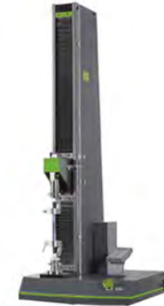
Universal Hardness Testers